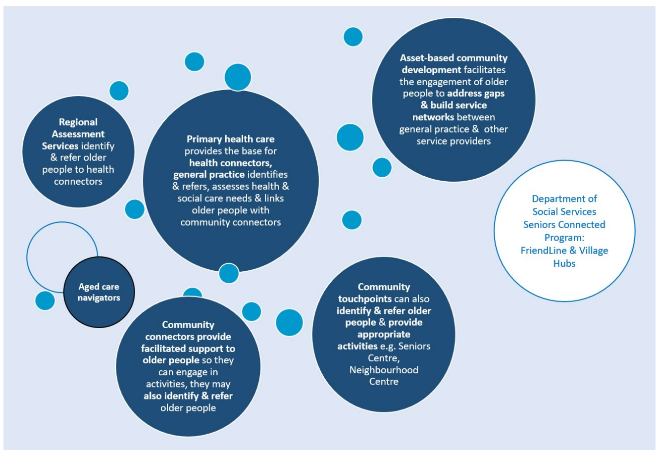
Figure 3 Components of an integrated model of care to strengthen older Australian’s social connections

The components of an integrated model of care to strengthen social connections of older Australians is presented in Figure 3.