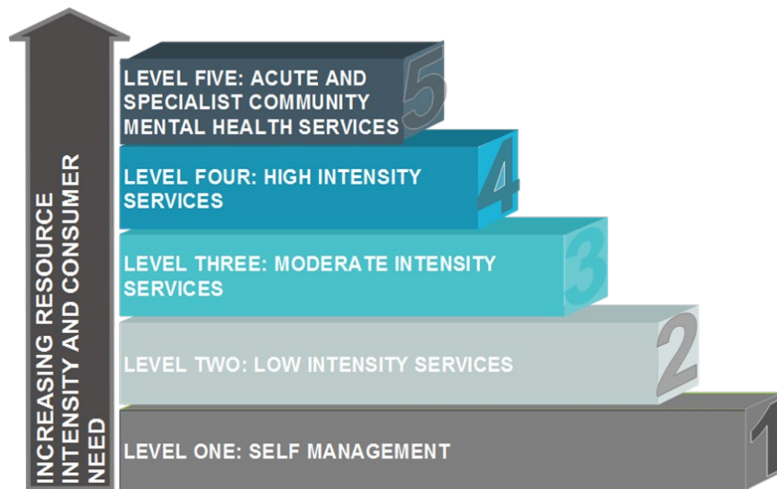
Figure 1 Schematic representation of levels of mental health care