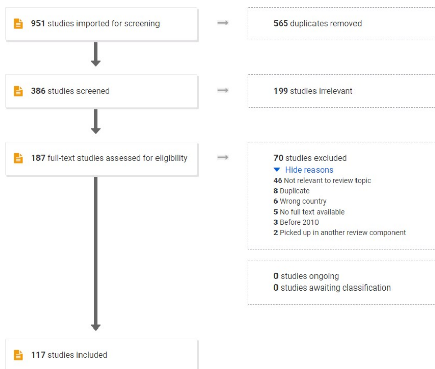
Figure A-1. PRISMA Diagram of Screening Process for Research Components 3 and 5.