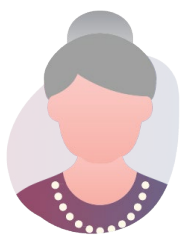
Illustration of elderly consumer

A useful tool for front line workers to have is an overview of the benefits of wellness and reablement to share with the client and their family/carer, as this is key to enthusiastic participation.