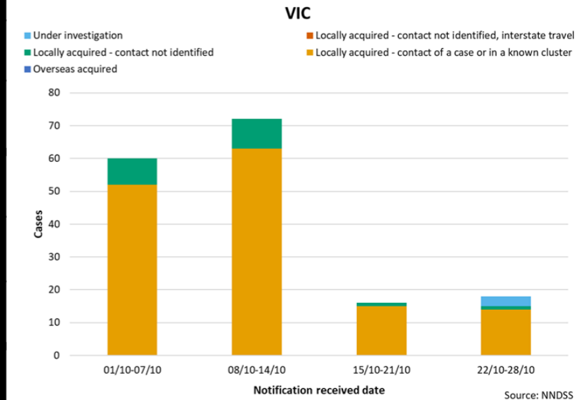
Weekly cases by source of acquisition