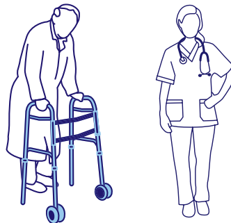
Keep up your regular home care and health care