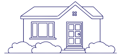
Stay at home when sick and get tested if you have cold and flu symptoms