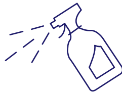
Clean and disinfect regularly