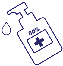
Using alcohol-based hand sanitisers (60% alcohol)