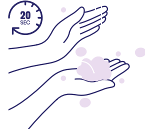
Wash hands regularly with soap and water