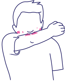
Cough or sneeze into your arm or tissue