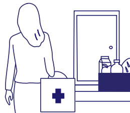
Consider having medicine, groceries and essential items delivered to your home