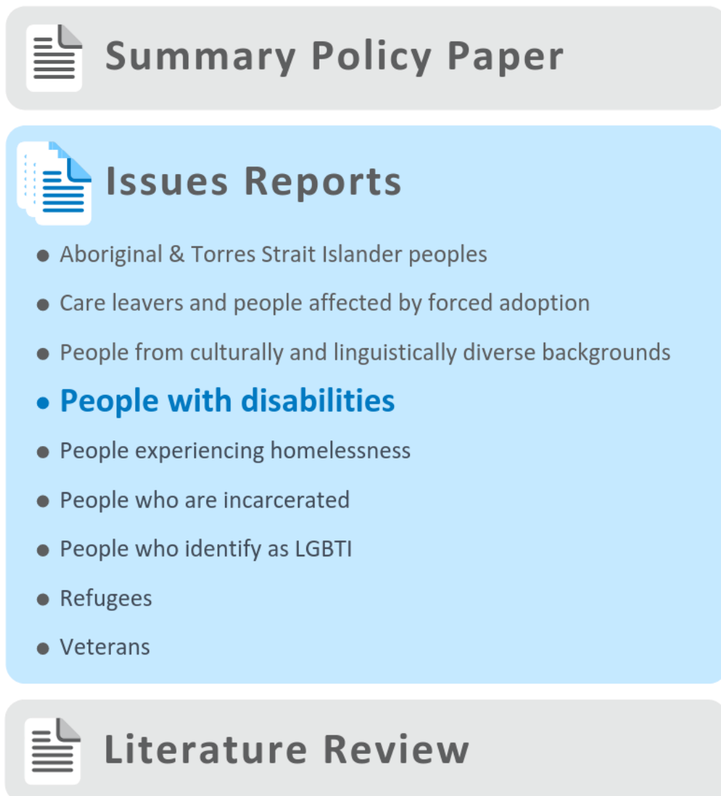
Figure 1-2: Suite of reports

This issues report is part of a suite of documents developed through the project, as shown in Figure 1-2 .