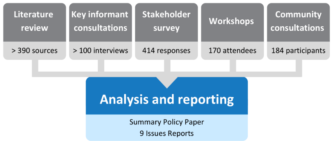
Figure 1-1: Project activities

Please refer to the Summary Policy Paper for more information on project methodology and limitations.