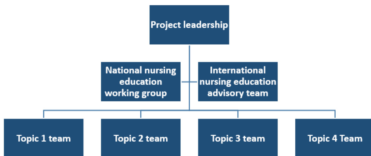
Figure 1 Project governance and implementation framework

The work of producing the literature reviews has occurred through four topic teams which included academic staff predominantly from the University of Wollongong, University of Sydney and Western Sydney University. Project leadership was provided by the Centre for Health Service Development and critical review and revision of the draft literature reviews supported by the School of Nursing, University of Wollongong. All personnel contributing to this project are acknowledged in Appendix 1.