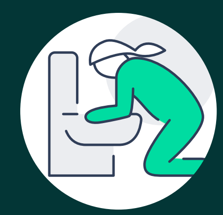
Vomiting and nausea