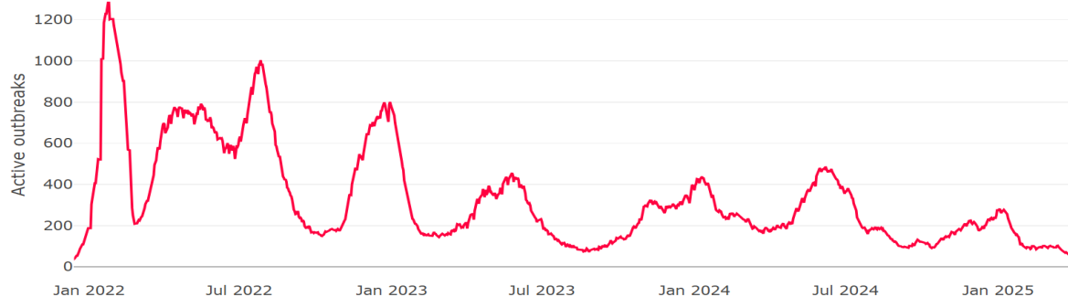
Figure 1: National outbreak trends in aged care – December 2021 to present

Notes: (i) Residential aged care case data as at 9 Apr 2025 (ii) The large increase in outbreaks on 16 January 2022 is driven by a reporting lag.