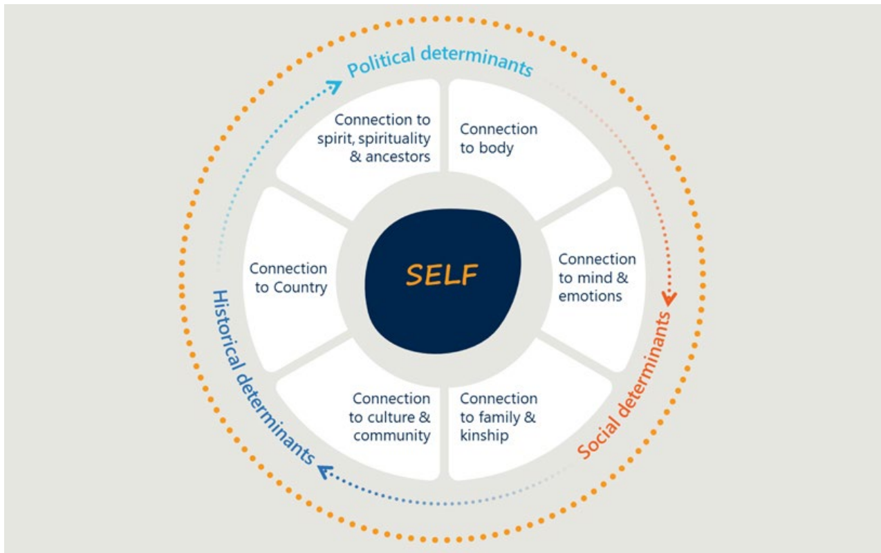
Figure 3 | Model of social and emotional wellbeing 63

There is opportunity to draw on successful Australian and international examples to pilot therapeutic models of custody prioritising First Nations mothers and young people.