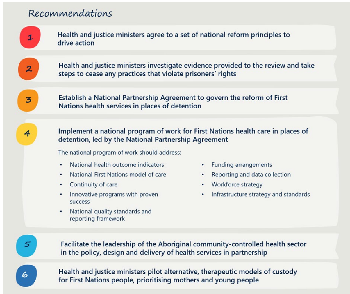
Figure 1 | Summary of review recommendations