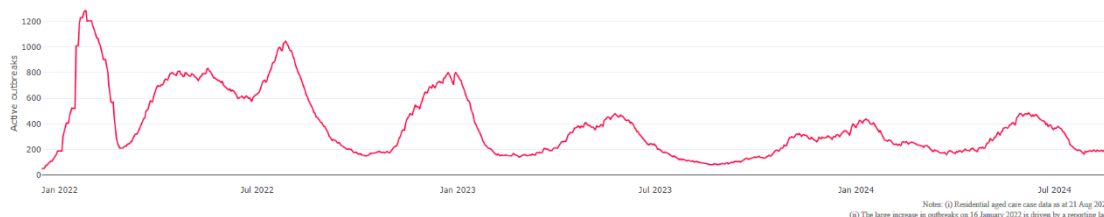
Figure 2: Trends in aged care cases – December 2021 to present