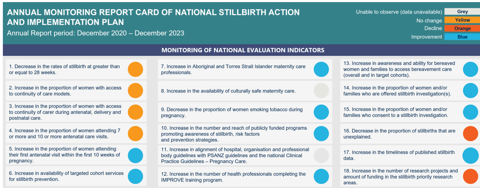
Figure 3 | Annual Monitoring Report Card – Outcomes update against national evaluation indicators

Figure 3 provides a snapshot of early outcomes observed from December 2020 to December 2023. Based on the sequencing and timing of activities under the Action Plan, some indicators are not expected to see improvements at this stage of implementation. Figure 4 provides an overview of the status of the national evaluation indicators mapped to the expected short-, medium-, and long-term outcomes outlined in the Action Plan.