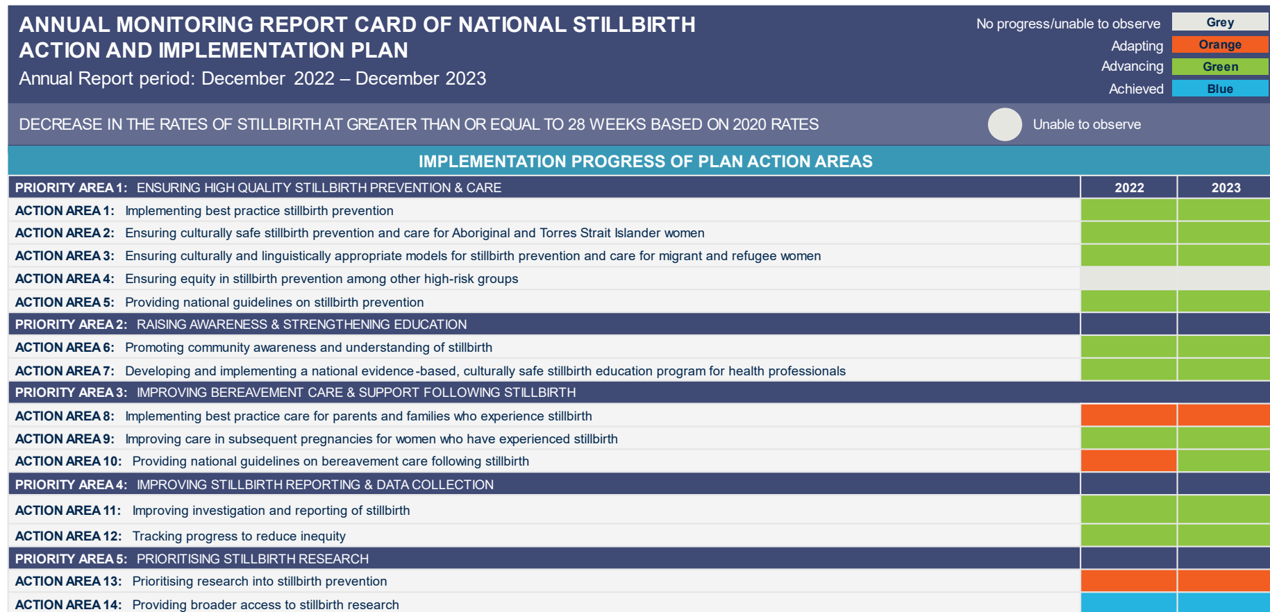
Figure 2 | Annual Monitoring Report Card – Implementation update against action areas

Figure 2 provides an overall snapshot of implementation progress from December 2022 to December 2023, with the previous year's results provided for comparison.