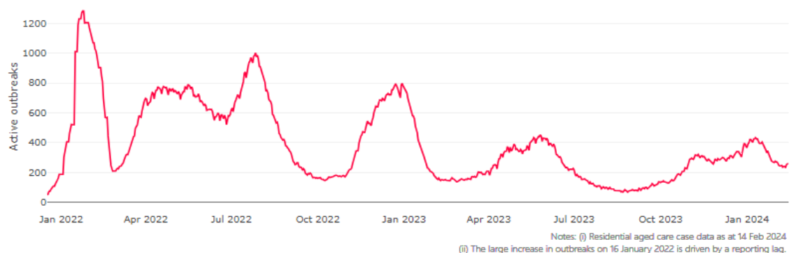
Figure 2: Trends in aged care cases – December 2021 to present