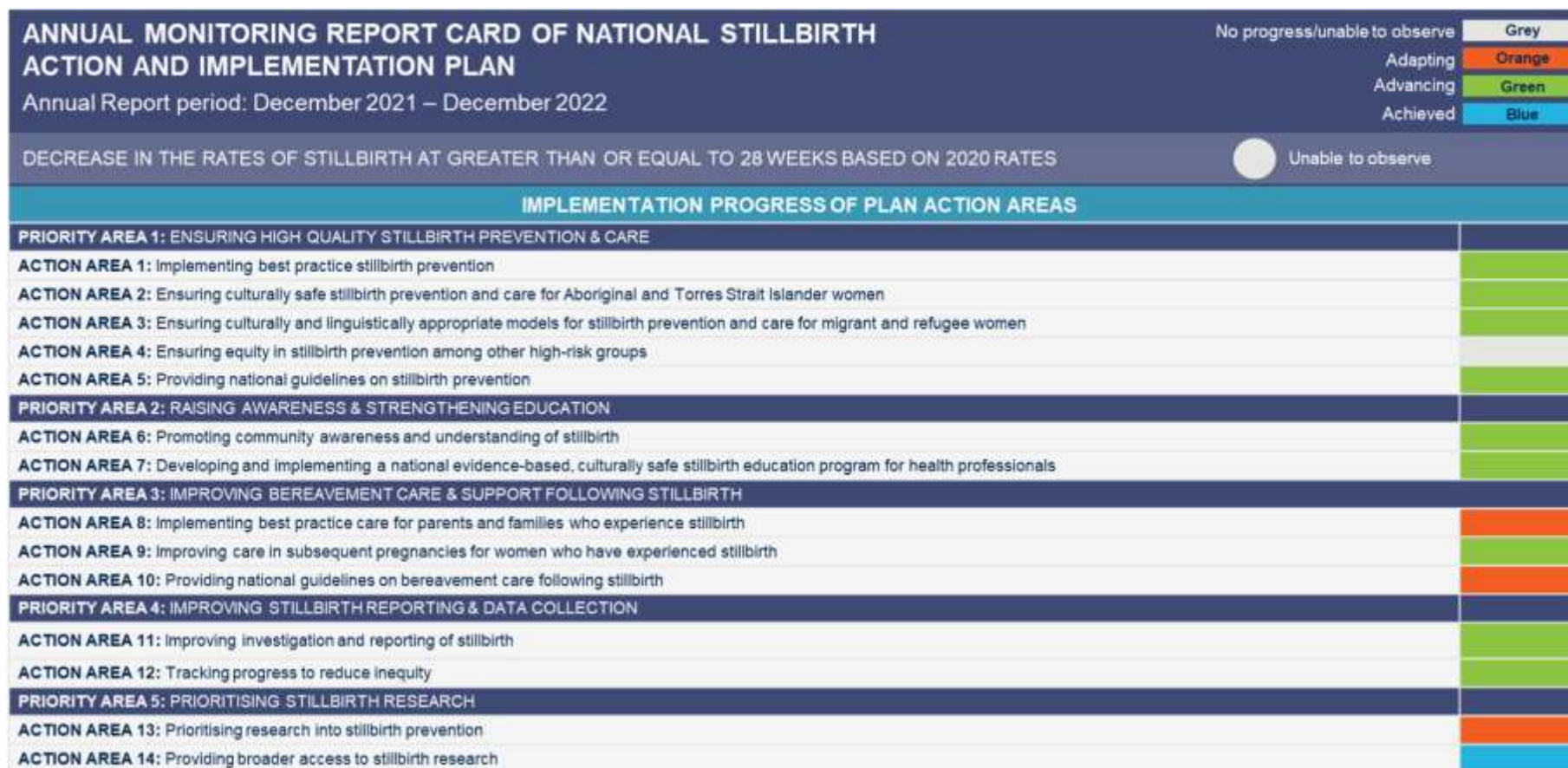
Figure 2 | Annual Monitoring Report Card – Implementation update against action areas

Figure 2 provides a snapshot of implementation progress from December 2021 to December 2022. The Implementation Update has been filled out based on information and the implementation traffic light system from the First Evaluation Report.