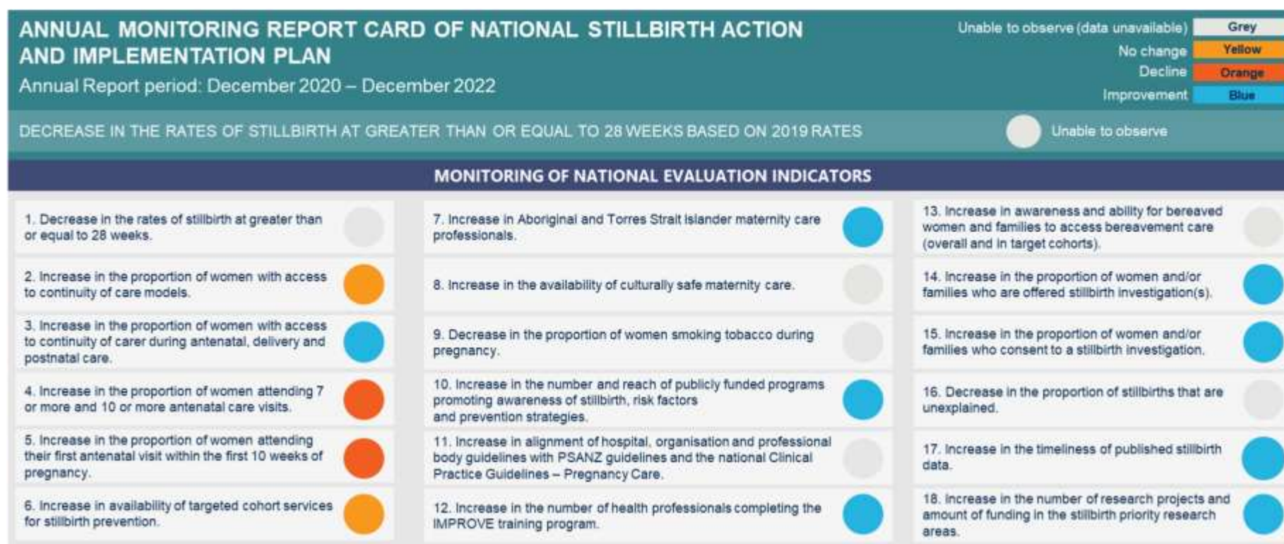
Figure 3 | Annual Monitoring Report Card – Outcomes update against national evaluation indicators

Figure 3 provides a snapshot of early outcomes observed up from December 2020 to December 2022. The Outcomes Update has been filled out based on information and the outcomes traffic light system from the First Evaluation Report. Based on the sequencing of activities under the Action Plan, some indicators are not expected to see improvements at this early stage of implementation (please refer to the First Evaluation Report for further details).