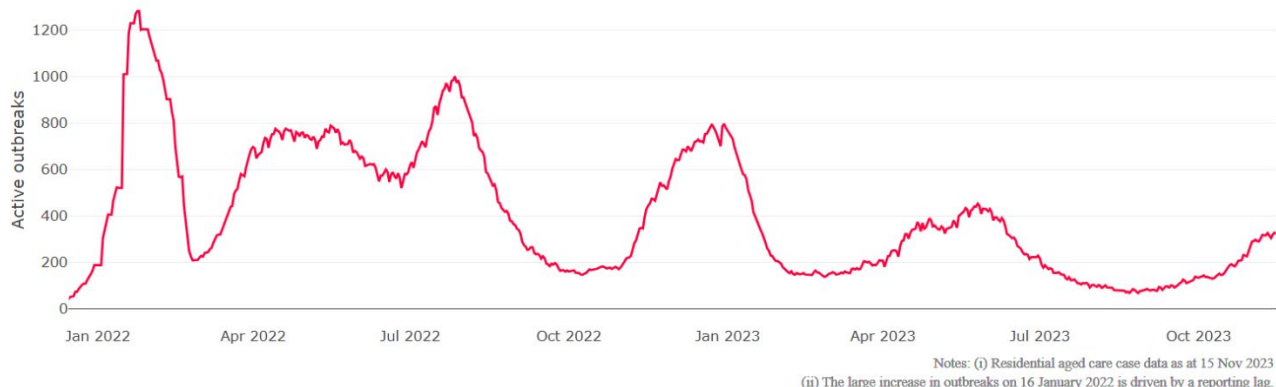
Figure 2: Trends in Aged Care Cases – December 2021 to Present