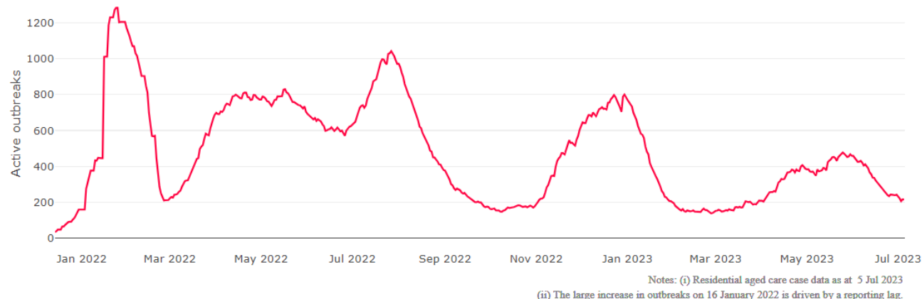
Figure 2: Trends in Aged Care Cases – December 2021 to Present