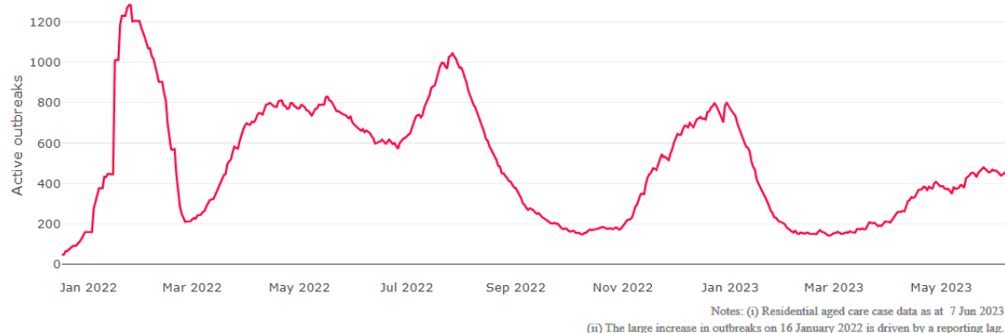
Figure 2: Trends in Aged Care Cases – December 2021 to Present