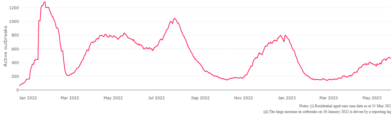
Figure 2: Trends in Aged Care Cases – December 2021 to Present