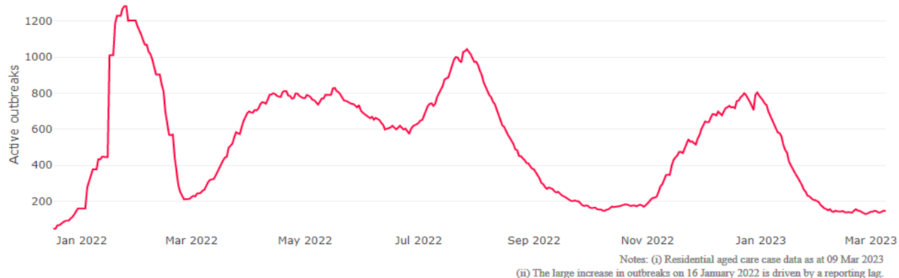
Figure 2: Trends in Aged Care Cases – December 2021 to Present