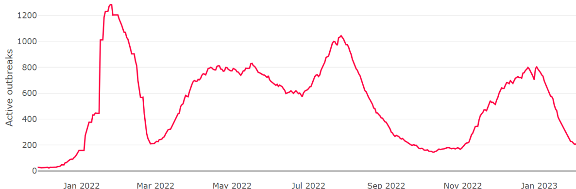
Figure 1: National Outbreak Trends in Aged Care

Notes: (i) Residential aged care case data as at 02 Feb 2023 (ii) The large increase in outbreaks on 16 January 2022 is driven by a reporting lag.