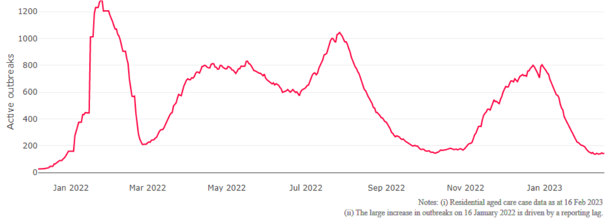
Figure 2: Trends in Aged Care Cases – November 2021 to Present