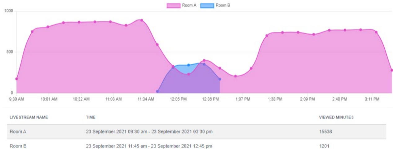
Table 2: Users per session