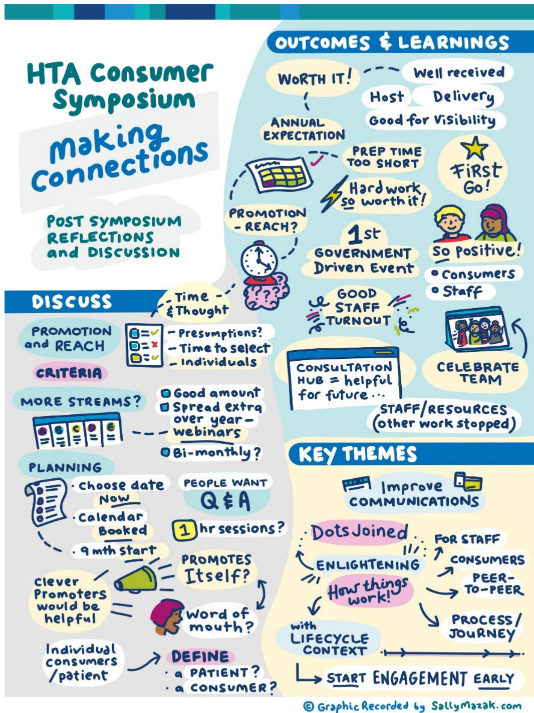
Figure 4: Graphic illustration of Post Symposium Reflections and Discussions

Everyone agreed the event was successful in achieving its aim of bringing people together and providing information about HTA. Other feedback included: