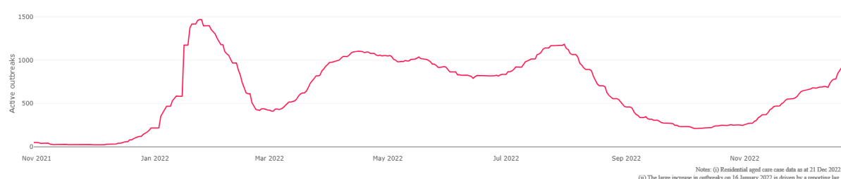
Figure 2: Trends in Aged Care Cases – November 2021 to Present