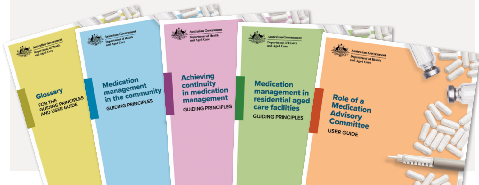
Figure 1: The 2022 editions of the national quality use of medicines publications